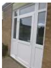
New double-glazed door for access.