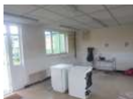
The room has been emptied, new double-glazed windows have been put in as suggested.